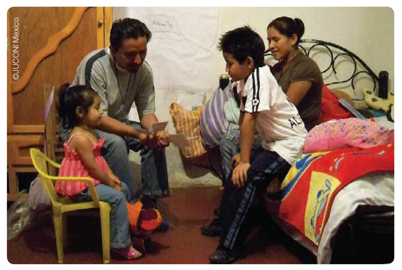
Illustration 3: A Family Team member engages in an activity during a home visit. He is wearing his personal safety plan on a cord round his neck. He is showing the family picture cards depicting faces with a variety of expressions. The children and their mother discuss the feelings these cards represent and the sorts of events that can lead to these feelings and learn to identify their own emotions.

Staff and children carry with them a small, laminated card with their personal safety plan (one of the strategies inherent in the Sanctuary Model). When emotions are escalating, the idea is to do something to calm or sooth yourself. These are ranked from 1 (managing slightly heightened emotions) to 5 (emotions that are spiralling out of control). It may be enough to do step one – e.g. breathing deeply, counting to 10, stepping outdoors. Stronger emotions could require the help of someone else, or the chance to talk to a trusted person. As this is an organisation-wide approach, all staff members (including administrative, finance and other staff with limited contact with children) learn about the use of these tools.