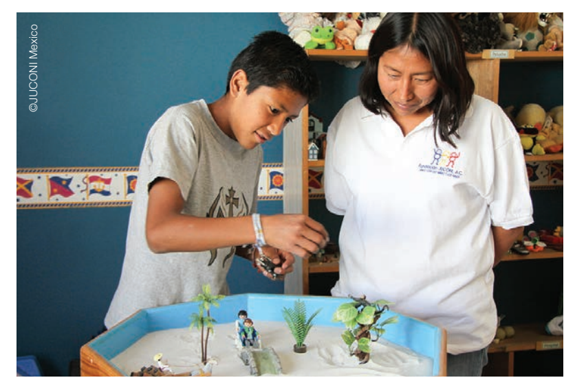
llustration 4: A child and therapist in a therapy session, using the sand box technique pioneered by Eliana Gil.