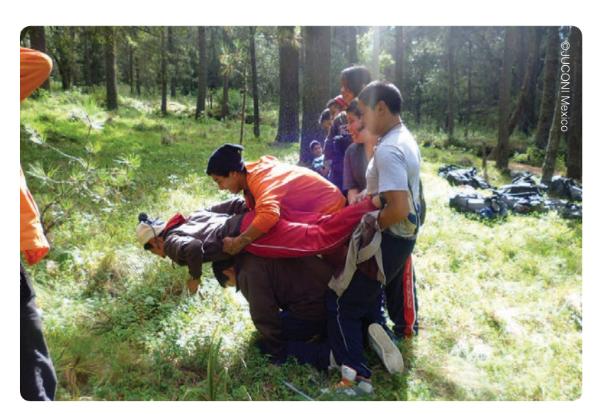
Illustration 1: JUCONI House hiking trip. This is recreation – with multiple therapeutic and educational functions as well.

intervention. Therapeutic intent is crucial to providing for the child or parent a different quality of relationship and experience to the ones they have so far experienced and one which will help them learn something about themselves and enable them to shift their perspective on life. Part of the creation of a therapeutic environment involves understanding the effect of even small interactions and routine activities. It also involves all staff being aligned both methodologically and in knowing the objectives and treatment plan for each child and family and using all interactions to work towards these. Hiking and camping trips (see below) are fun, but also opportunities to learn how to relate and work in a group in exacting conditions, how to manage frustration (rage!) and other emotions in new settings and more positively, how to set and achieve goals. Camp leaders/educators work with individuals and with the group.