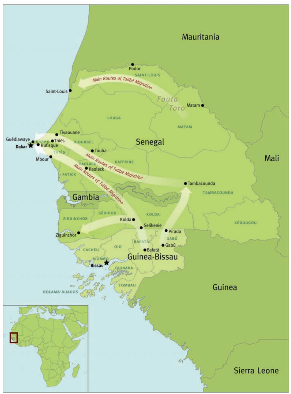
Map of Senegal and Guinea-Bissau