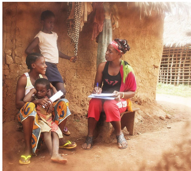
OVC case management CV during household visit.

As CVs conducted beneficiary home visitation, they provided counseling services including child abuse counseling and psychosocial and adherence counseling support. Beneficiaries highly valued the psychological and social support of OVC and caregivers and felt that programming that caters to the psychosocial needs of OVC was essential to supporting vulnerable households. The study found that psychosocial support was mainly provided through home visits where CVs provided direct services and referrals for additional care if required. Caregivers felt very positive about the psychosocial support provided, as many stated that it helped them share the OVC's HIV status with them. Some of the respondents appreciated the counseling on child nutrition that helped them monitor the growth of their children and ensure they were healthy. Other participants mentioned that they appreciated the encouragements the community volunteers gave regarding ART adherence. Respondents identified receiving emotional support, as well as the reassurance that ECR would assist them if they encountered challenges as a useful component of the program.