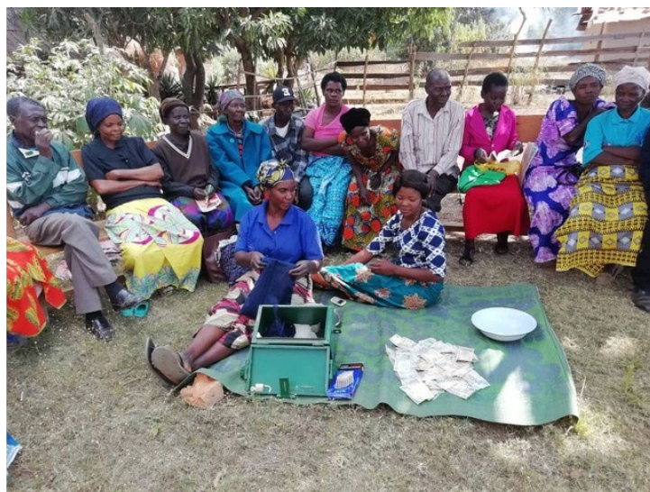
CSG holding a savings meeting.

Beneficiaries felt the economic strengthening programming undertaken by ECR was highly beneficial to their financial stability, but given the severity of their needs, they identified several challenges where greater support was required. Through use of Community Savings Group approaches, caregivers were encouraged to open saving groups that did not rely on the program for sustainability. CVs supported the formation of CSGs to ensure the households they served had access to credit if needed. Caregivers were linked to these savings groups as a way of supporting them to manage their household economic status. Some caregivers reported benefiting from these savings groups through the ability to mitigate financial risks by saving, borrowing money when they needed it, and repaying their loans on time. Caregivers relied on savings groups for things like children’s school fees, medical bills and establishing businesses. Additionally, these savings groups gave them an opportunity to share and exchange ideas, encouraging community interaction and cohesion.