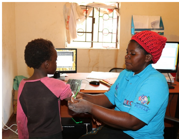
Nutritional assessment using mid-upper arm circumference tape.

“The feeding programs were also very helpful; they demonstrated using a wrap which had colors like green, yellow and red. This was meant to show people how to monitor the growth of a child. Most people have children, but they don’t know how to take care of them or what to feed them.” — Male caregiver, Lusaka