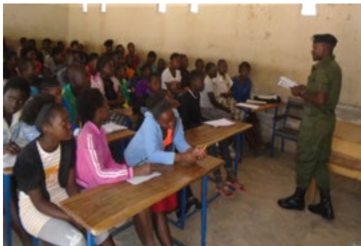
Child protection awareness.

Cognizant of the challenges already discussed in the communities where the program was implemented, ZAMFAM invested in several interventions aimed at improving livelihoods for program beneficiaries. Health and HIV-related challenges arising from adolescent pregnancy, prostitution, and early marriages were previously identified as challenges. Child protection services were also available to address issues linked to early marriages and sexual abuse in addition to psychosocial counseling and other services. Additionally, in addressing unemployment and education challenges, economic strengthening approaches and providing educational support responded to community needs. Child protection services also provided trainings for OVC caregivers to address some of the