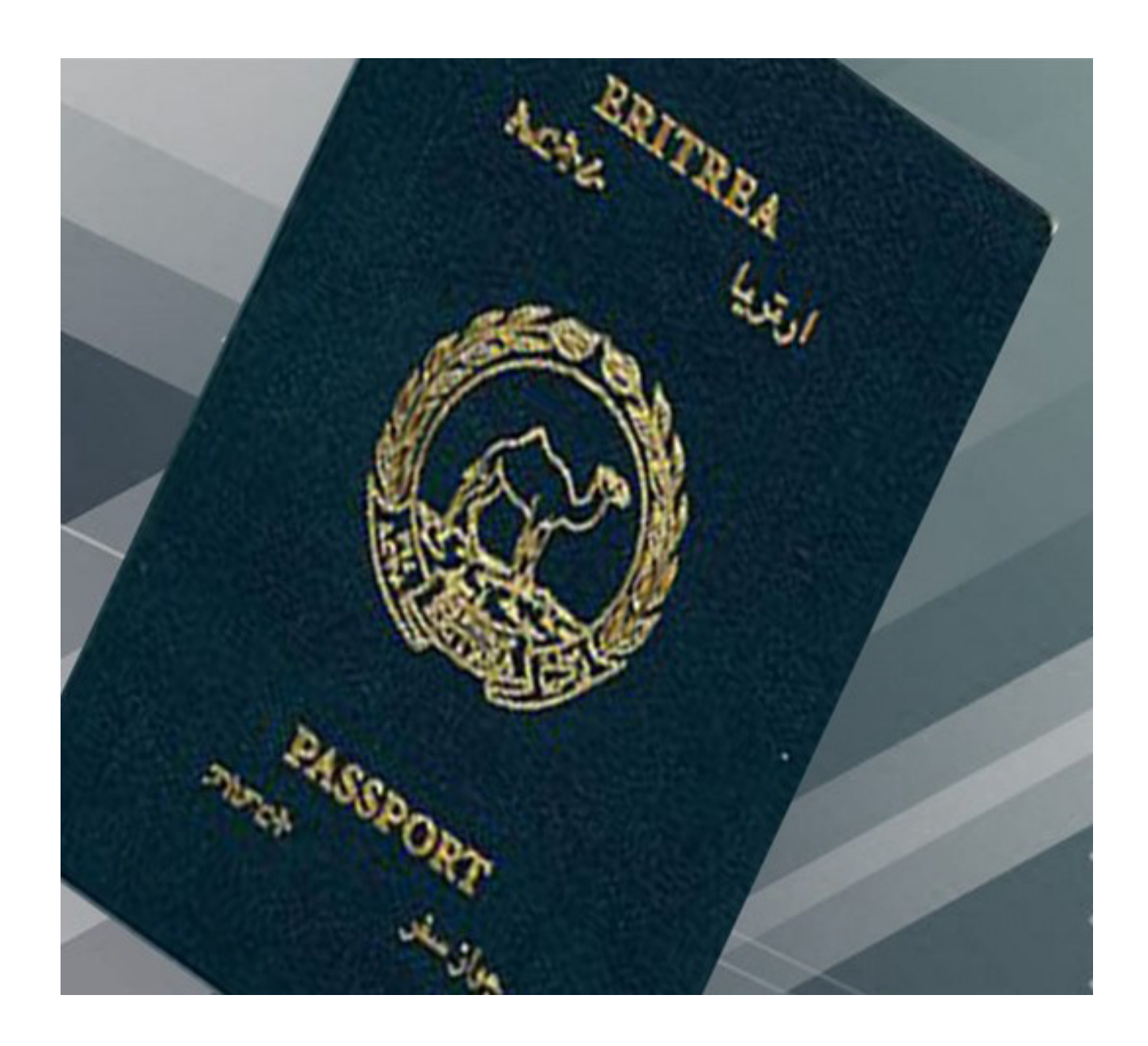
Appendix 4: A specimen of the Eritrean passport