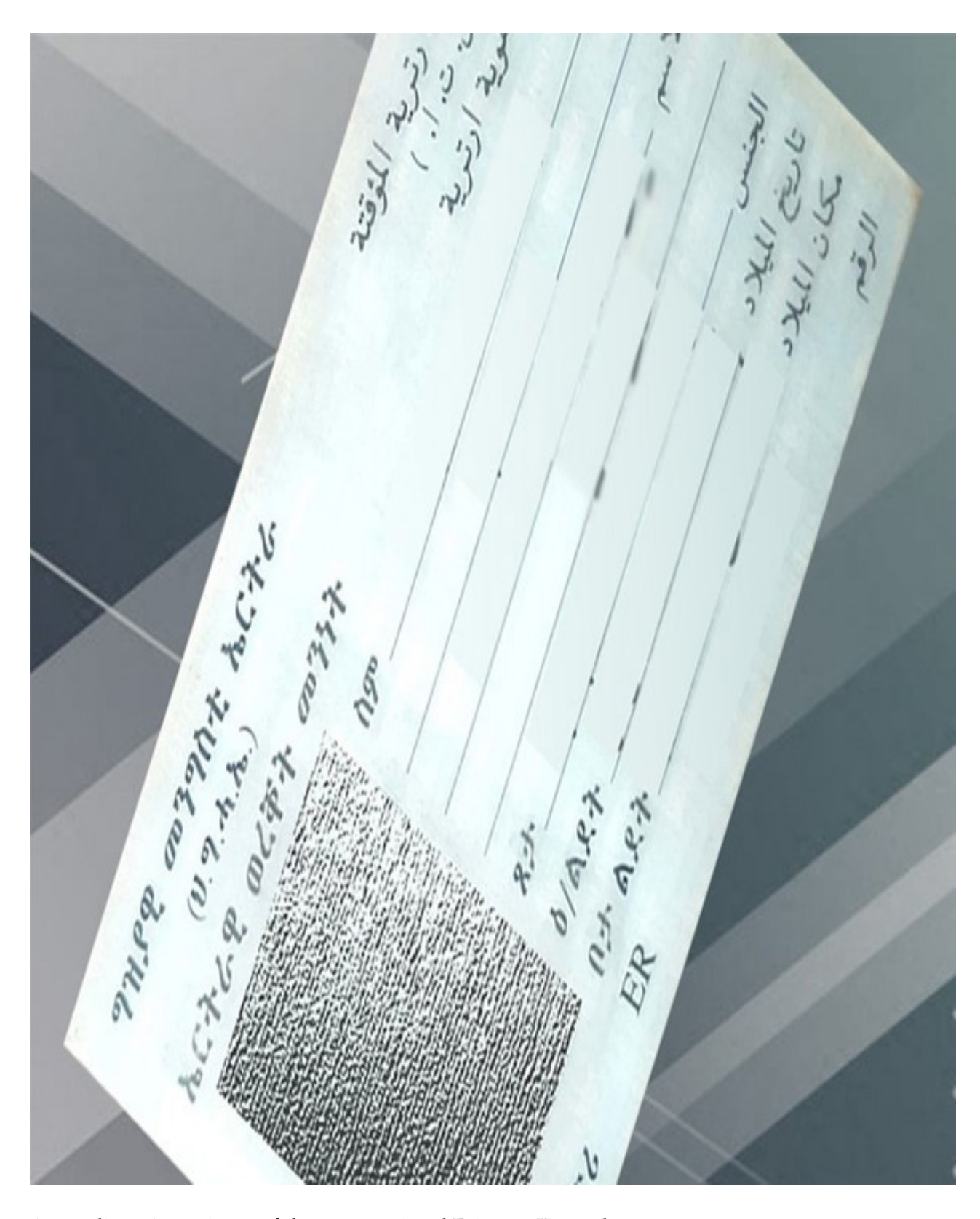
Appendix 3: A specimen of the 1993 national Eritrean ID card