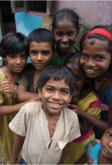
Children gather to greet CRS staff members on a field visit to educational and empowerment projects in the migrant community of Madhavi, northeast of Mumbai, India.

A cause is an underlying factor that exists in the community, organization, or external environment that has brought about a problem. Effects are social, environmental, political, or economic conditions, usually negative, that result from the problem 5 .