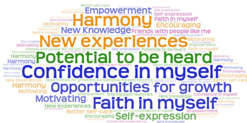
Word Cloud: What I gain from participation... in three words or less

On October 14, 2021, twelve care leavers from Guatemala gathered to officially launch the first network of care leavers, " Unidos por el Cambio " (United for Change), with the aim of advocating for family care, becoming spokespersons of care reform by sharing their experiences and promoting changes, and supporting other care leavers in learning to live independently. The group developed an annual activity plan and completed two training modules on the child protection system and the child rights. As part of strengthening this group the