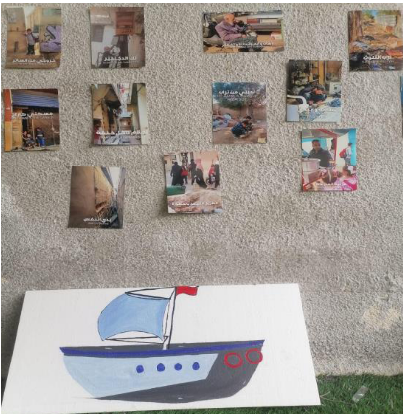
Part of the children’s photographic exhibition concluding their Photovoice project with Naba’a.

But beyond policy and technology are people. As we have seen, it is trusted information and a caring adult that plays the largest positive role in the integration and overall well-being of an unaccompanied child. To truly benefit from the arrival of young people from other places, a society must be open to change and humble enough to learn from others. There are many ways to achieve that, but they require leadership: at the top, but also in churches and community centres, businesses and schools. Let us close with an image: a two-lane, three-pillared bridge. The first pillar represents the child’s past, the second their present, and the third, their future. The unaccompanied child is journeying across this bridge, but there are people, mostly locals, in the other lane; they meet the child where they are, are interested in where they have been, and provide the insight and encouragement they need to get to the end of the bridge.