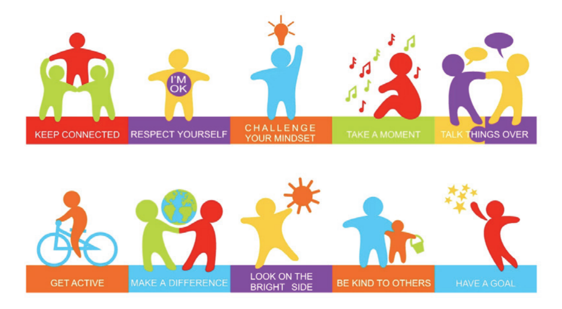
Diagram from Stenhouse Primary School: https://stenhouseps.com/building-resilience/

Practice three resilience-building skills you learned in Session 4: Resilience