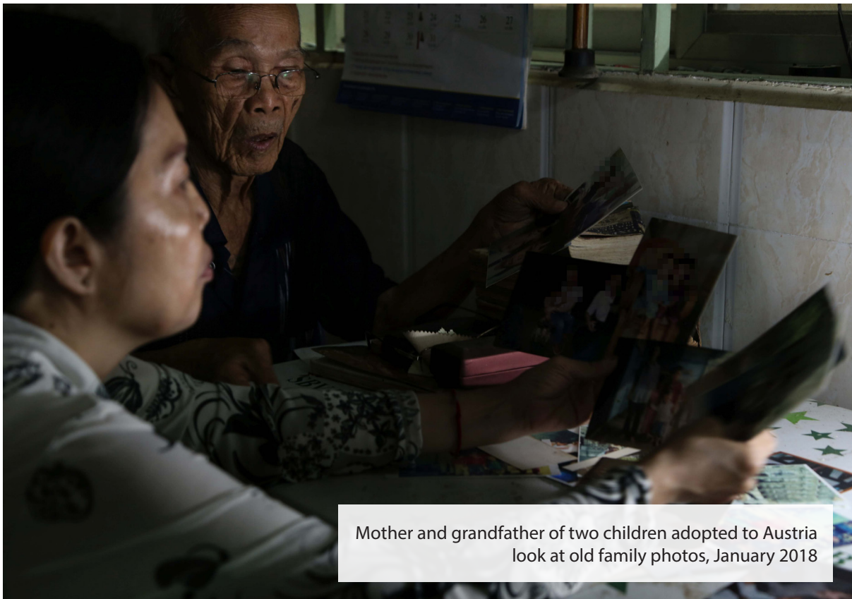
Mother and grandfather of two children adopted to Austria look at old family photos, January 2018

A fter her two remaining children left the orphanage in 2014, the mother wrote to the Cambodian National Assembly asking for information about her children. She received a response from MoSAVY stating that both children were in Austria but that they could not give her their addresses because according to the Inter-Country Adoption Law the adoptions were full adoptions meaning that there was to be no more relationship between