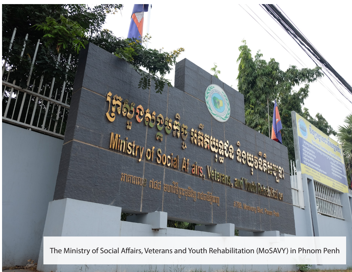
The Ministry of Social Affairs, Veterans and Youth Rehabilitation (MoSAVY) in Phnom Penh

necessary for international adoptions to take place. 5 Typical cases involved poor women who were often widowed or divorced and struggling to look after babies or young children being approached by recruiters who suggested that the children could live in an orphanage where they would be cared for. The mothers were told they could visit their children and that when they were financially better off they could take their children back. The children were then taken to orphanages connected to adoption facilitators who were often working for overseas adoption agencies. The orphanages obtained the paperwork necessary for adoption to take place from local authorities, such as village chiefs, often in return for bribes. Typically this paperwork stated that the children had