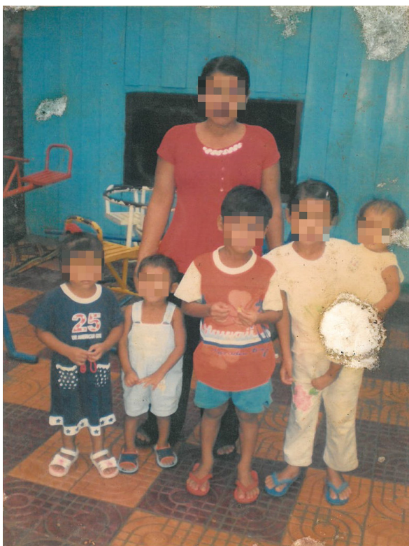
Cover photo: Mother and children, four of whom were adopted to Italy in 2008-9, see case 3