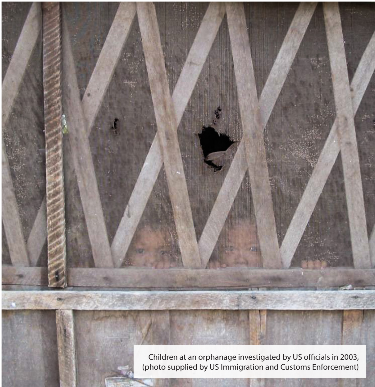
Children at an orphanage investigated by US officials in 2003

very high. In relation to the legal framework, it stated that the official procedure and the law enforcement situation did not provide “the safeguards necessary to carry out international adoptions in manners that would protect the interests of the children, the biological parents, or the prospective adoptive parents”. 11 As a result of the findings of the review, the Netherlands suspended adoption from Cambodia in May 2003. Other countries followed, including the UK, France and Germany. However, despite the findings of fraud and corruption in the adoption process, many countries continued throughout