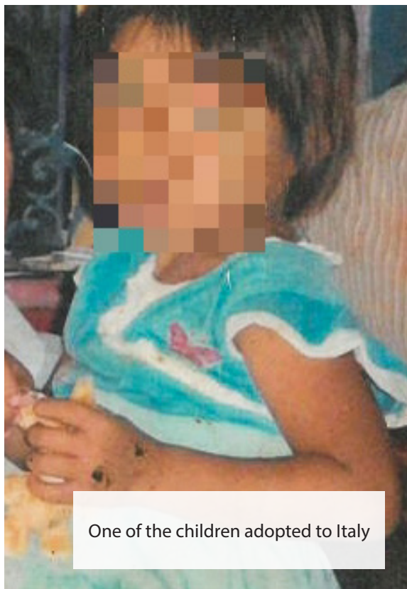
One of the children adopted to Italy

live in the orphanage for free and would have the chance to study and get good jobs. He did not say anything about adoption. The parents decided to keep their oldest and youngest children with them but to send the other four to the orphanage. The mother travelled to the orphanage with the director and her children and stayed there for a couple of nights. She saw that the conditions were good and the children seemed well cared for so was happy to allow her children to stay.