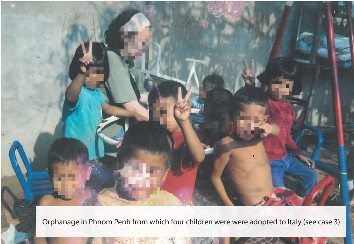
Orphanage in Phnom Penh from which four children were adopted to Italy (see case 3)

re-establish contact and at the very least receive news of them. LICADHO is attempting to help the women achieve this by contacting relevant authorities and other parties both inside and outside Cambodia. This has been a slow and difficult process and it is ongoing. Fraudulent adoptions are a problem wherever international adoptions take place. 2 Despite this and despite the existence of international law covering inter-country adoptions, there is no clear and agreed procedure for addressing historic cases of fraud either in Cambodia or internationally. This makes it extremely difficult for the victims of fraud to obtain any kind of redress.