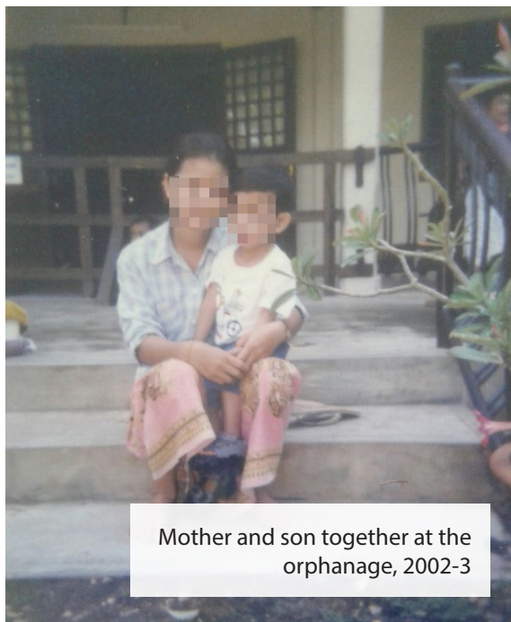
Mother and son together at the orphanage, 2002-3

After he left, the mother continued to visit the orphanage about once a month to ask for news of her son. The director used to tell her that he was fine and not to worry. Years passed and