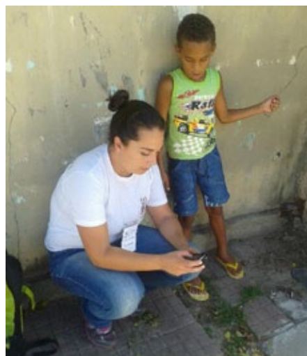
Igarapé team has been testing ICT use with children in low-income areas of Recife with great results

And yet despite all the progress and potential, it is essential to acknowledge that digital data collection and fly-over mapping can and should never replace the richness of qualitative and participatory research. Mobile phones have limited storage capabilities and the focus of most data collection ICTs continues to be on quantifiable metrics. These new tools, while offering huge potential in getting to grips with VAC, should where possible be supplemented by qualitative research methods including local interpretation of research findings. Abuse, neglect, maltreatment, harassment are all incredibly sensitive and culturally complex issues that are not easy to talk about, let alone digitally map.