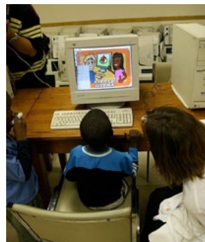
Special interfaces and grafic designs that appeal to children can be used to facilitate the use of ICT for their protection.

The term mPreventViolence emerged in 2011 after the name of a landmark workshop hosted by the Institute of Medicine in Washington December 2012. It featured interesting case studies from the high-income countries highlighting successes in adding mobile components to parenting projects and the analysis of big data to detect risks and patterns of suicide. Unfortunately the workshop also revealed an absence of rigorous assessments from the South. 123 The youth health tech (YTH) project from the US is an example of how the advancement of technologies is being promoted to help young people access reliable information, have their voices heard and live lives without shame or fear. With a strong focus on violence prevention, there is great potential for global replication of YTH. 124