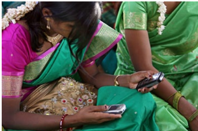
Cellphones are easily accessible and their use is now widespread in most parts of the world, even in the Global South.

In addition the Internet, SMS can be used to collect inputs from children and youth en masse . In Nepal for example, UNICEF teamed up with a local radio station for youth and launched a campaign that allows young listeners to take an active role in a conversation, all via SMS. 86 Agencies can also target SMS campaigns at vulnerable groups with specific messages in local languages, often giving the option to provide feedback free of charge. Such SMS campaigning offers an easy and cost-effective way of reaching a large number of people, the drawback being that someone has to collect the phone numbers onto a database and keep it updated 87 and there remain challenges to text messaging in low-literacy populations. 88