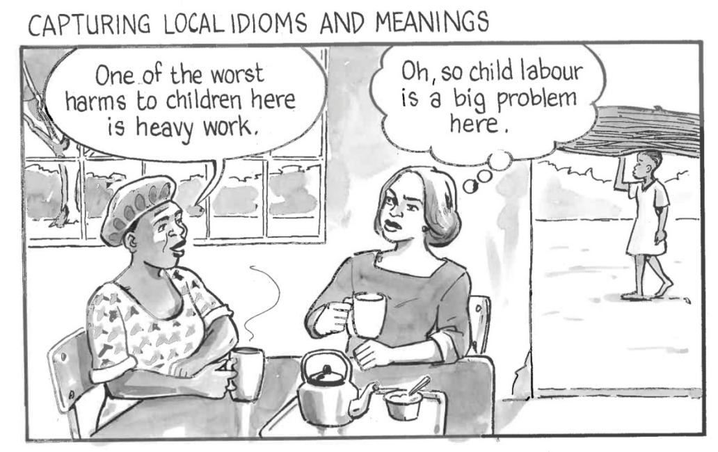
Do both people have the same understanding?

Of course, narrative methods have significant limits. If one wanted to know how much violence against children actually occurs, narrative methods might not yield the most accurate information. Parents may underestimate how often or how severely they beat their children since factual information about that could threaten their image of being good parents who care for their children and avoid cruelty. Because there is often a gap between what people say and what they do, it is useful to use participant observation to complement narrative methods.