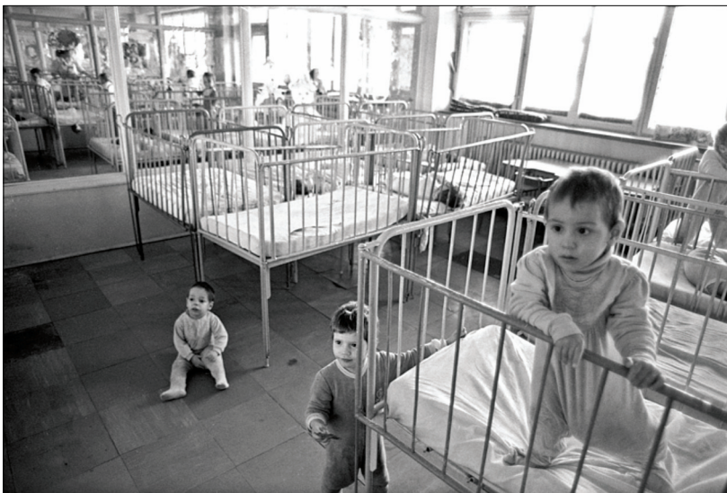
Figure 2: Sleeping quarters in a state-run institution in Bucharest, Romania

under-stimulation. 44 Supporting this contention, the ERA study noted that duration of deprivation longer than 6 months among its 144 participants was associated with smaller head circumference independent of nutritional status. 45 In 2007, a meta-analysis to quantify growth deficits reported a combined effect size of exposure to institutional care on height of d=-2.23 (95% CI -2.62 to -1.84 ) among 2640 children in regions including eastern Europe, South America, and Asia. However, the variable age of the children at assessment complicates interpretation. Within this same study, meta-analysis of a subset of 893 children (eight studies) removed from institutions before 3 years of age found that longer duration of institutionalisation was associated with more substantial height deficits ( d=1.71 ,