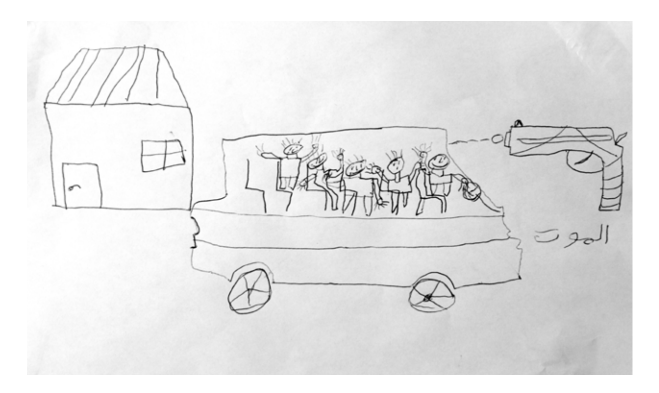
This picture was drawn by a nine-year-old boy while his family were registering as refugees at Tyre registration centre, Lebanon. The bus that he and his family took to flee their home in Syria was stopped and robbed by armed men. To the right of the bus, the boy has written the word "death."

(IMC) in Irbid, Jordan, has worked with more than 90 Syrian refugee children over the past nine months. She has met a number of children who have not only seen their family members killed before their eyes, but have then helped