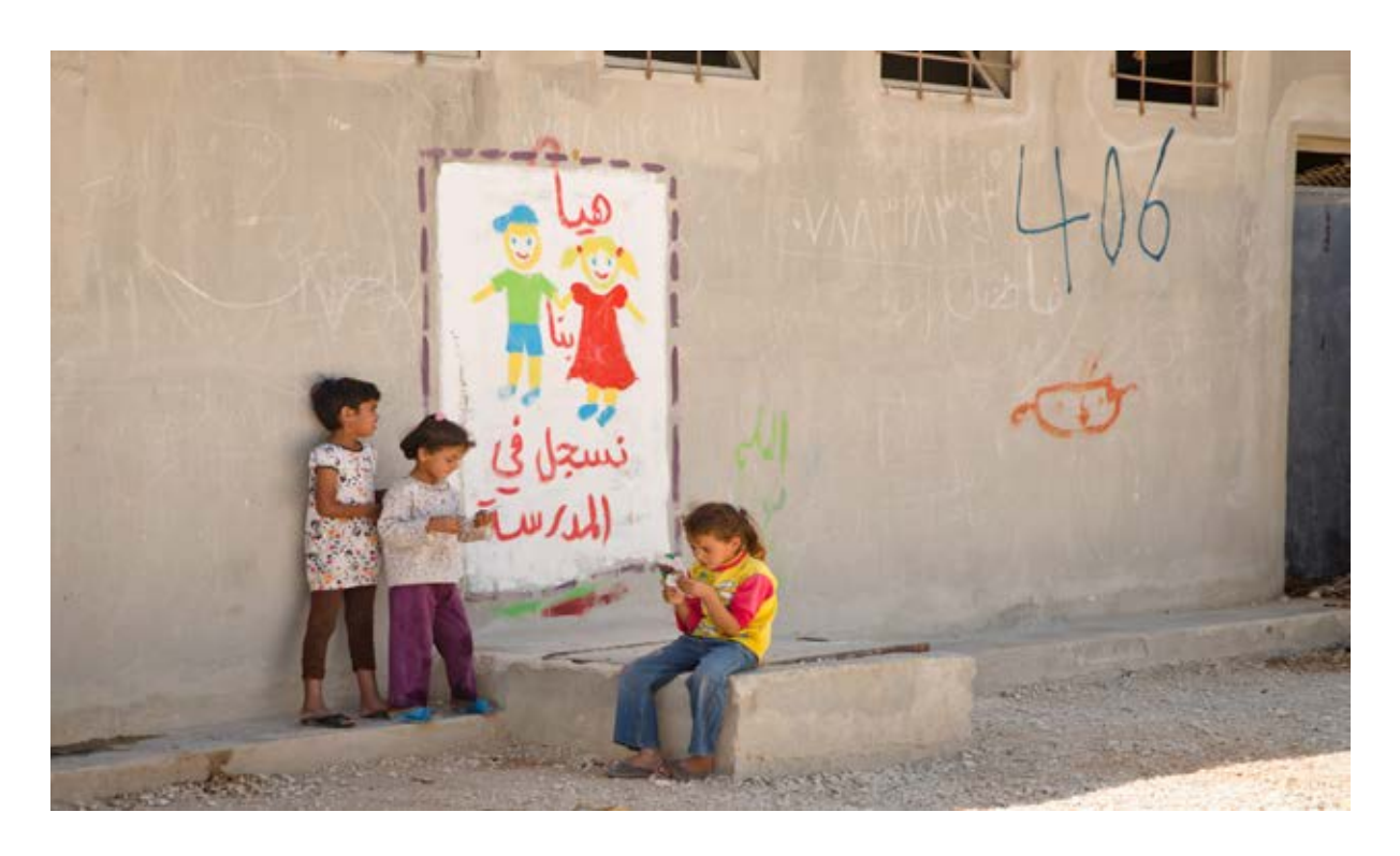
A mural painted by children in Za'atari refugee camp that says "Let's go register for school."

not being educated, and without education there is nothing. We're heading towards destruction."