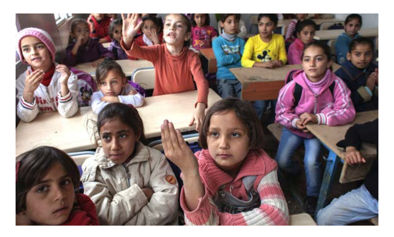
Syrian children attend class at a primary school in Domiz refugee camp in the Kurdistan Region of Iraq. Syrians, even those of Kurdish ancestry, seldom attend public schools in the Kurdistan Region, where the language of instruction is Kurdish, because they are accustomed to attending Arabic-language schools in Syria.

a particular problem for older children. It is easier for younger children to pick up a new language, and their Lebanese peers are also less advanced. Despite the difficulties in learning a new language, a number of Syrian refugee children see this as a valuable opportunity.