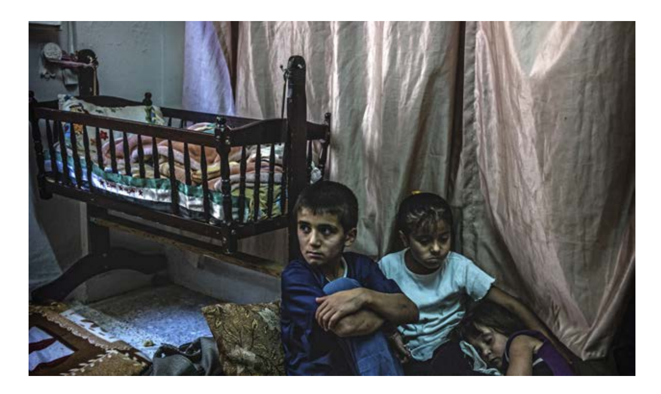
These children live in a tiny apartment in the suburbs of Amman. The television is one of the only sources of entertainment. With family still inside Syria, the parents often follow Syrian channels that show graphic images of violence, destruction and death.

a constant backdrop in Homs—unsettling. He was worried it would start again.