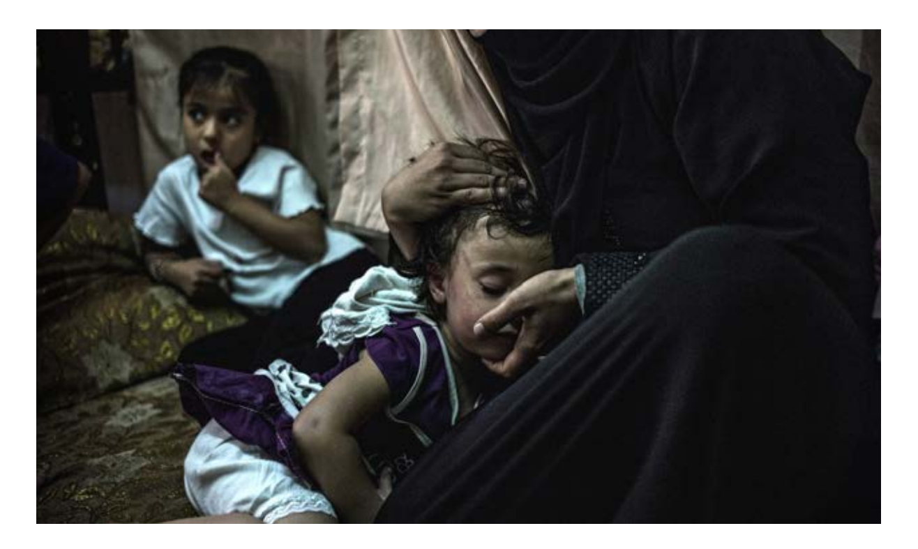
A Syrian refugee mother living in Amman, Jordan, shows the wounds on the face of her young daughter after she was hit by a neighbour.