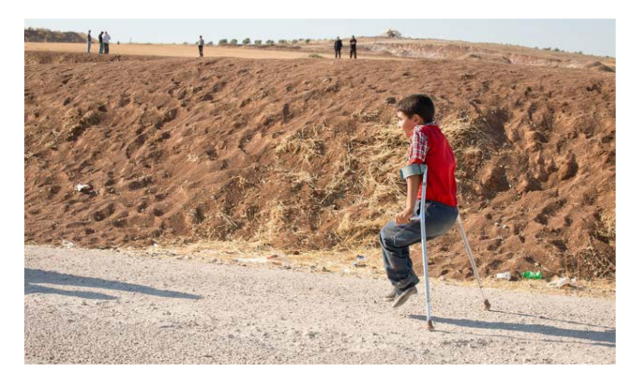
A young Syrian refugee enters Jordan on crutches.

friendly spaces. Children also receive psychosocial support through NGOs and community centers, as well as at UNHCR registration centers.