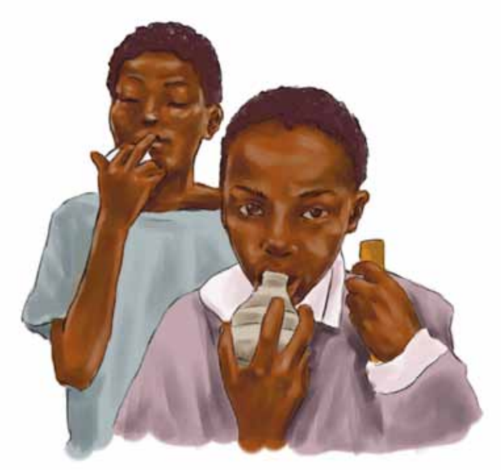
Figure 5: Drug abuse in the juveniles

The counsellor's job is to assist the client to help himself or herself. For the client to feel safe enough to open up about her/his thoughts and feelings, he/she needs to feel safe, respected and understood.