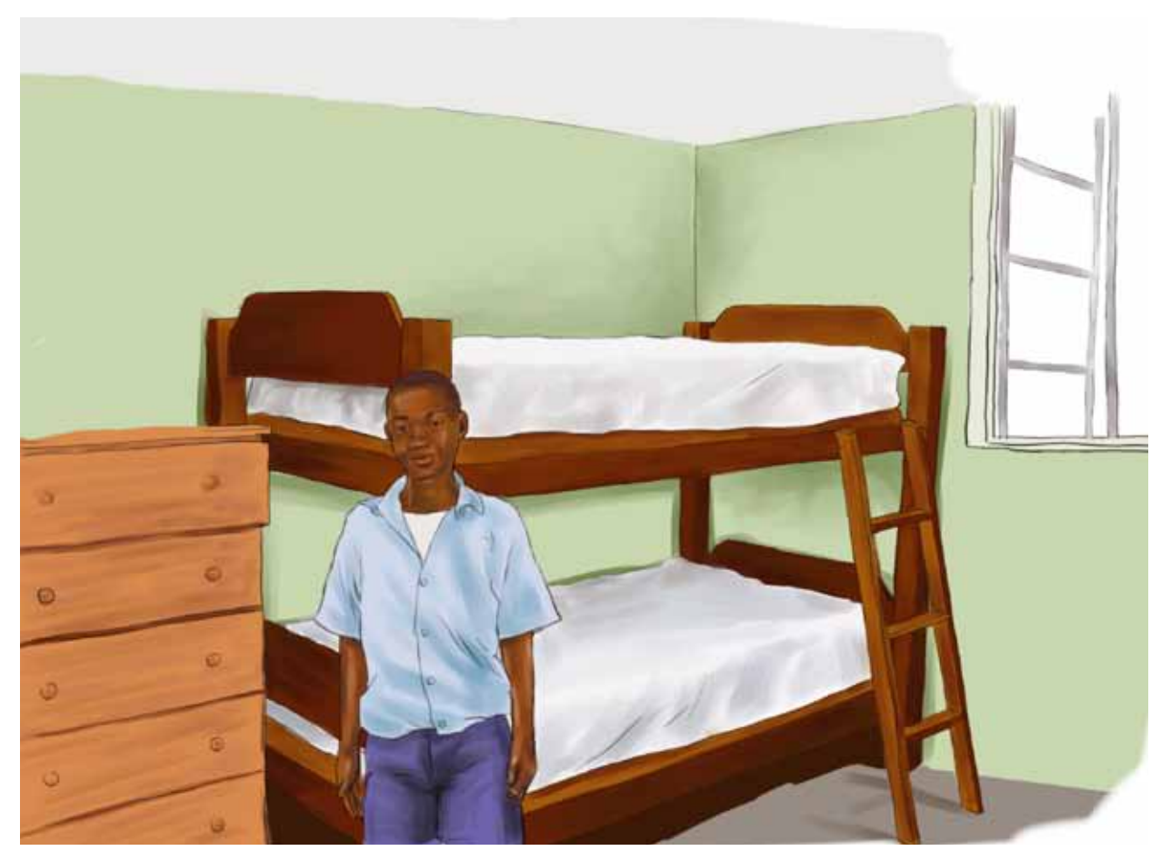
Figure 4: Clean and airy sleeping quarters in a CCI.