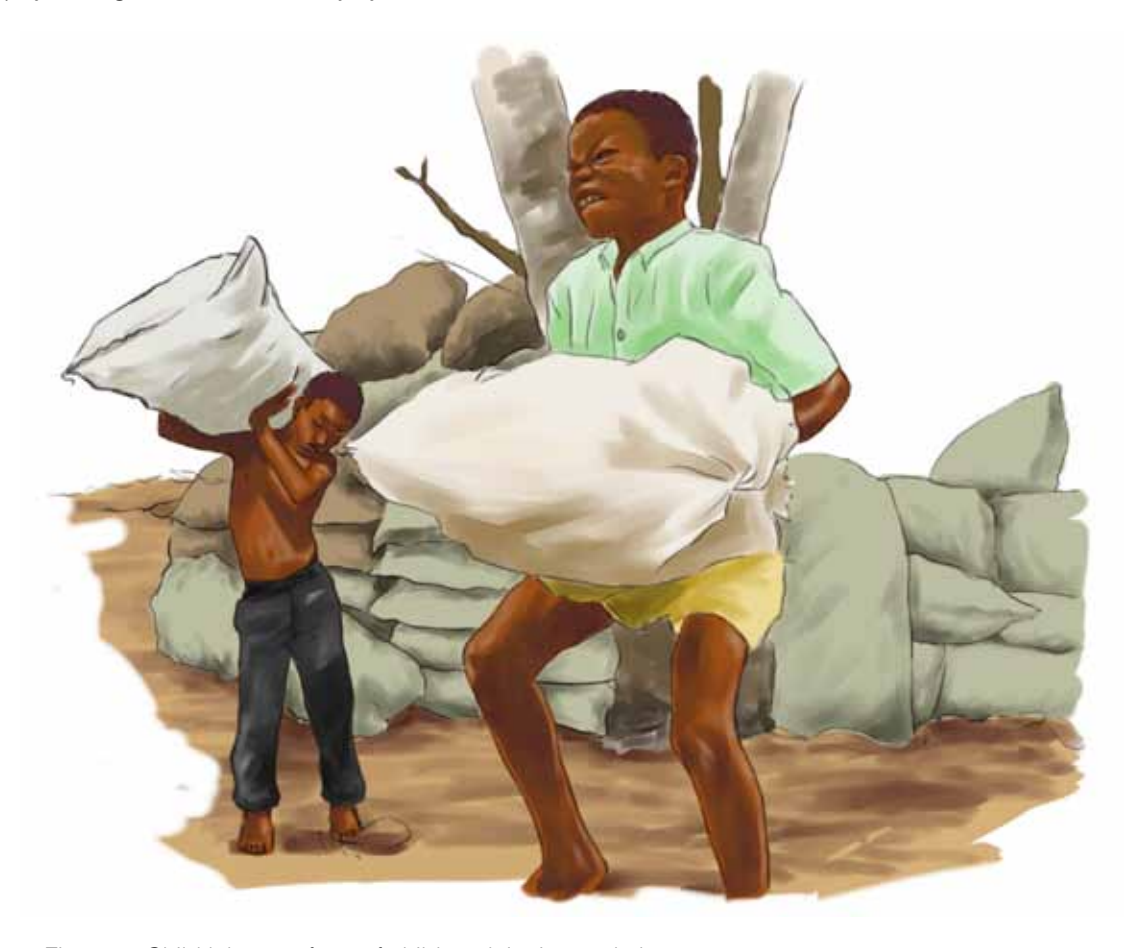
Figure 2: Child labour, a form of child exploitation and abuse

The Children's Act No. 8.2001 defines child abuse as anything that causes physical, sexual, psychological and mental injury to a child.