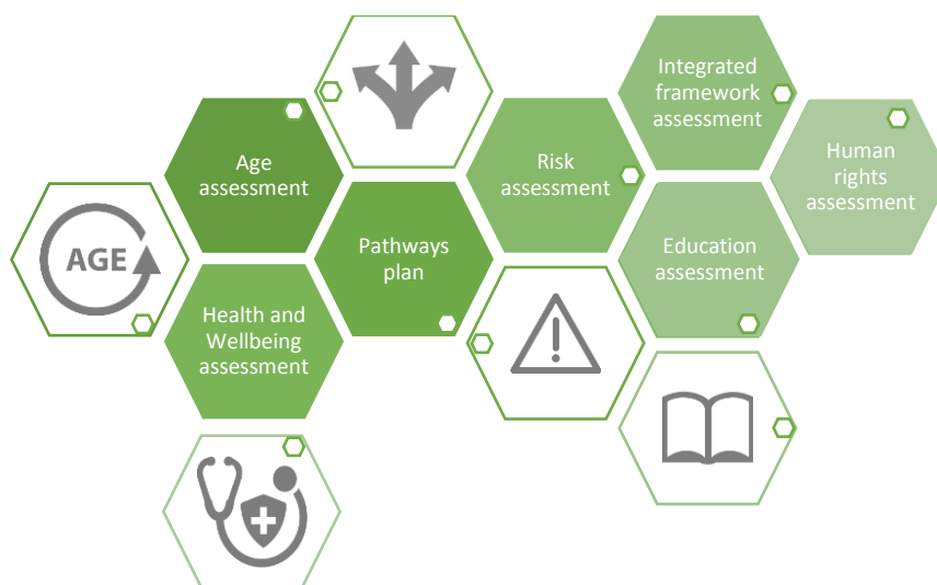
Figure 1: Assessments used by local authorities

In order to determine the needs of UASC, the data has revealed that the experience of authorities tends to be characterised by a number of different assessments and plans. Crucially, not all of these were mentioned by all of the authorities, and often they were not specific, hence reference to generic 'risk assessment'.