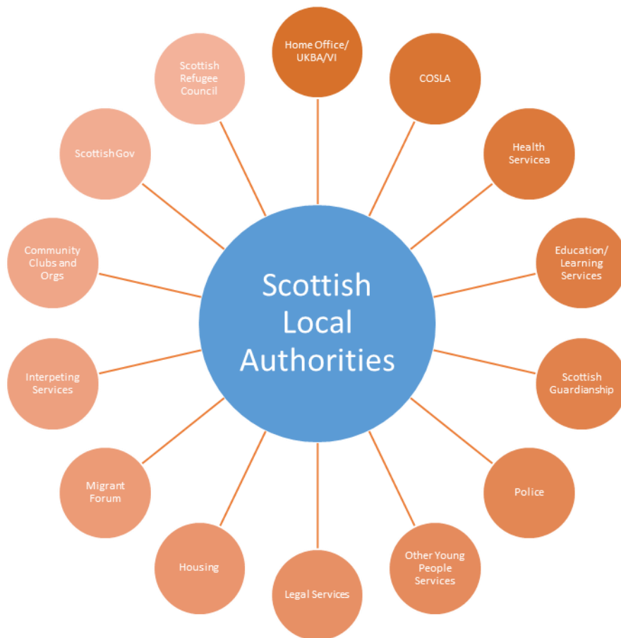
Figure 2: Most frequently mentioned organisations that Scottish local authorities routinely engage with

Local authorities' experiences of working with UASC brought them in to contact with a number of other agencies including government bodies, health organisations, immigration services (legal and statutory) and interpreting services. Contact with other bodies was cited as being of value, and for those authorities with fewer networks, this level of support was highlighted as crucial. Although authorities often draw on support and information from their networks – usually in recognition of the need for specialist knowledges – they also approached other local authorities that were more experienced for guidance.