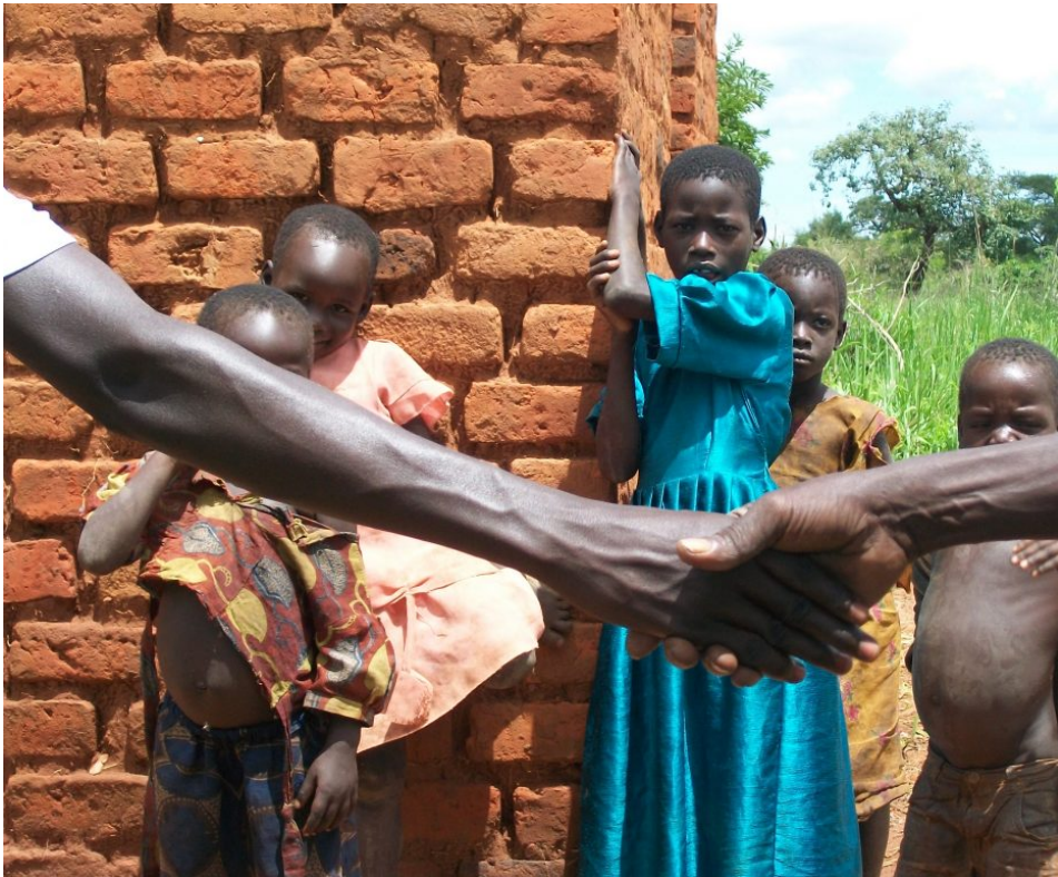
Children in Ongako sub-county, Gulu, Uganda.