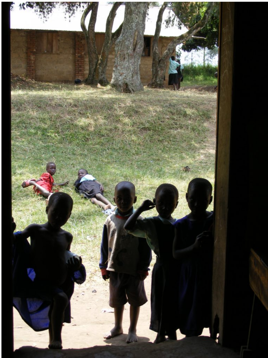
A group of curious Ugandan schoolchildren peer in the classroom of a village school

Volunteering with children may feel good but could be harmful. There are some better ways to help them.