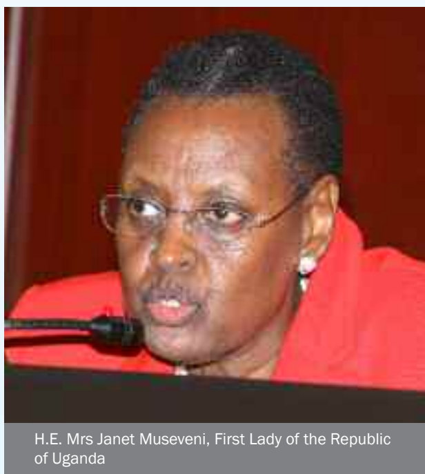
H.E. Mrs Janet Museveni, First Lady of the Republic of Uganda

Mrs Museveni's Keynote Address was based on her experience gained by working with vulnerable children in Uganda. She expressed her strong reservations about intercountry adoption as a solution for children in need of alternative care in Africa. Adoption itself is a foreign concept in Africa.