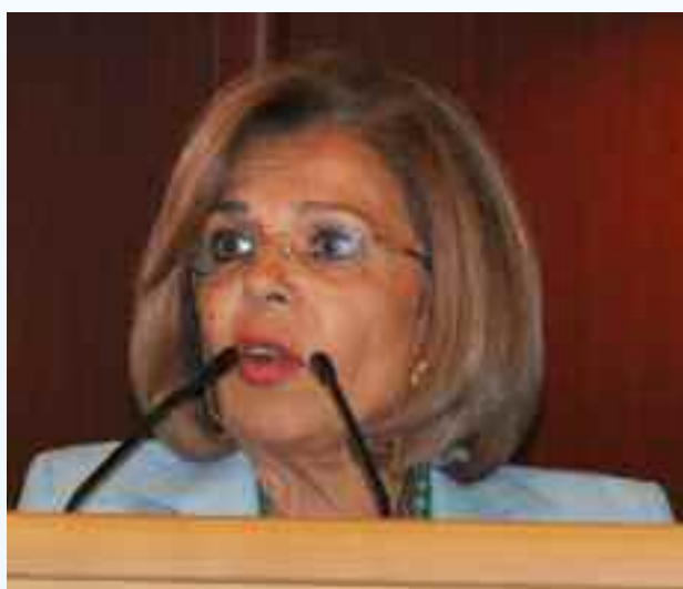
Dr Moushira Khattab, Former Minister of Family and Population, Republic of Egypt; Former Vice-Chair of the CRC Committee

Dr Khattab set out the reasons for MENA (Middle East and North Africa) countries not having ratified the Hague Convention. Adoption is prohibited by law in these countries with the exception of Tunisia. Instead, Egypt and the other MENA countries provide for a system of alternative care called kafalah. She explained that kafalah is a commitment to voluntarily take care of the