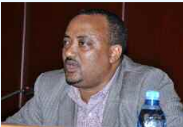
H.E. Almw Mengist, State Minister of Women, Children and Youth Affairs, Federal Democratic Republic of Ethiopia

Ethiopia remains amongst the poorest countries in Africa; with 52% of the population below the age of 18, the population is vulnerable. In recent years, there have been encouraging results in relation to health, education and other sectors through the implementation of social support systems. When the impact of these results trickle down to family level, it will contribute to curbing the problem of vulnerable families and children, leading to a significant decline in the number of vulnerable children and a reduction of intercountry adoption.