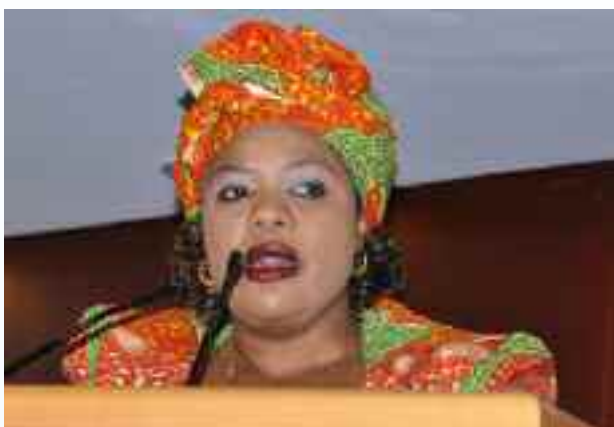
Hon. Mrs Anita Kalinde, Minister of Gender, Children and Community Development, Republic of Malawi

Mrs Kalinde indicated that, despite efforts to reduce poverty, 52% of the population in Malawi live below the poverty line and 10% of children grow up without parental care. The Government recognises the need to address the root causes of poverty, HIV/AIDS and other problems related to child care and protection and intensify the social support system.