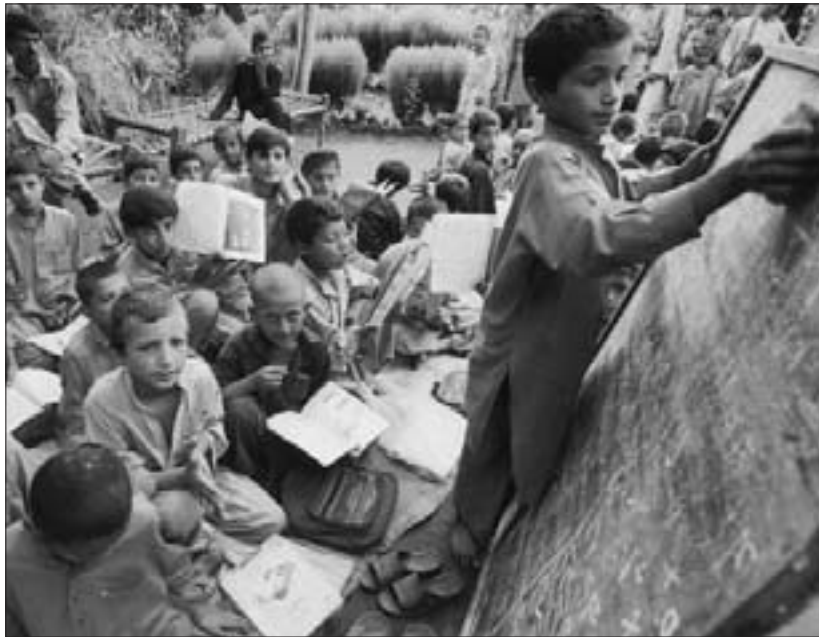
Literacy classes in an Afghan refugee camp in Pakistan

and CCF sought to generate community support for the education of Roma children. This took many forms: in some communities, Roma children were escorted to school by other children; in more hostile areas they were escorted by parents. Both organisations also sought to include the Roma in wider community activities, such as sport or cultural activities like dance.