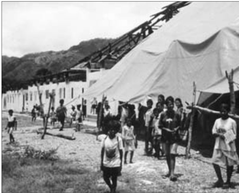
A makeshift school in East Timor

In 2002–2003, the UNESCO International Institute for Educational Planning (IIEP) and Section for Support to Countries in Crisis and Reconstruction are developing a joint programme to ‘build governments’ capacity to plan and manage education in emergencies’. Beginning with the documentation of case studies that illustrate different emergency profiles, researchers will review education responses in East Timor, Honduras, Kosovo, Palestine and Rwanda. In addition to drawing out lessons learned and producing a series of policy studies, materials will be developed to conduct training with ministries of education (Talbot, 2002). Concurrently, the UNESCO International Bureau of Education (UNESCO IBE) is undertaking a study on curriculum change and social cohesion in conflict-affected societies (Tawil and Harley, 2002). Research will take place in Bosnia-Herzegovina, Guatemala, Lebanon, Mozambique, Northern Ireland, Rwanda and Sri Lanka.