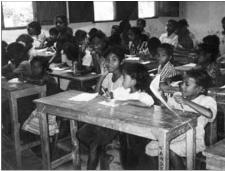
A classroom in East Timor